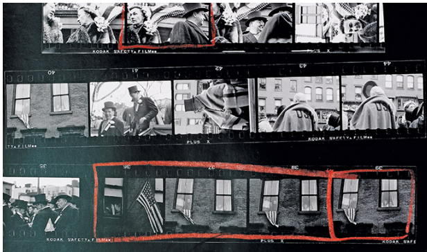
Detail Robert Frank Contact Sheet