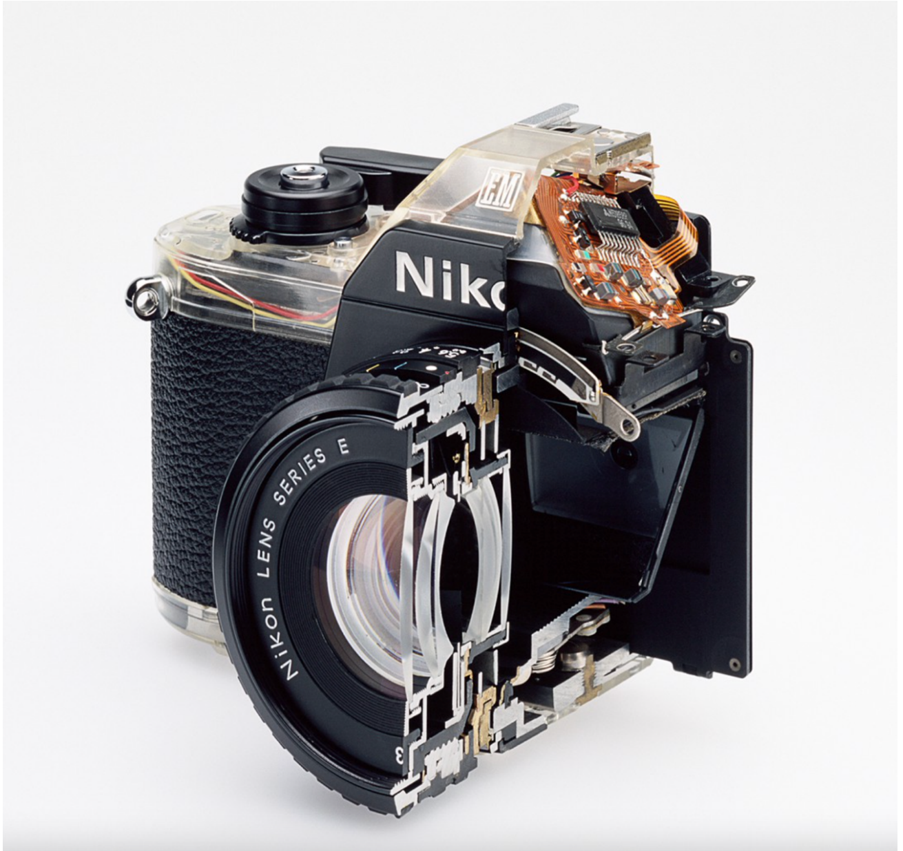
Cutaway model Nikon EM. Shutter (2007)